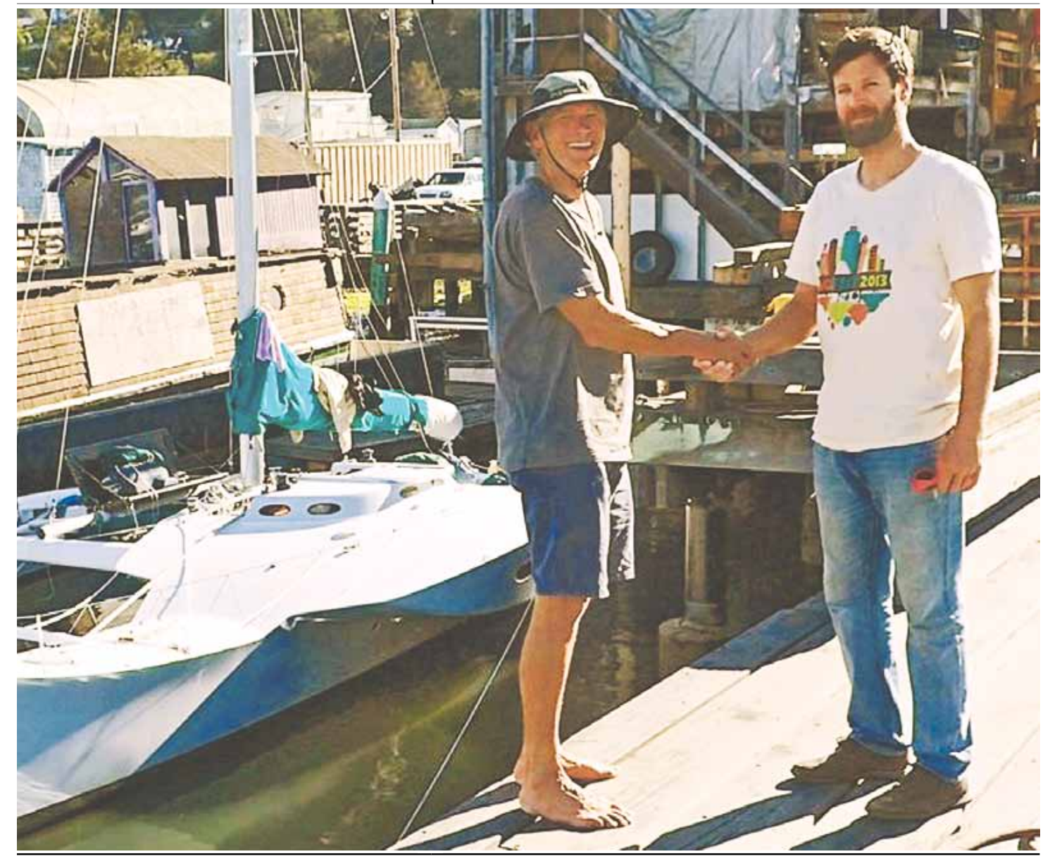
February, 2016 • Latitude 38 • Page 53